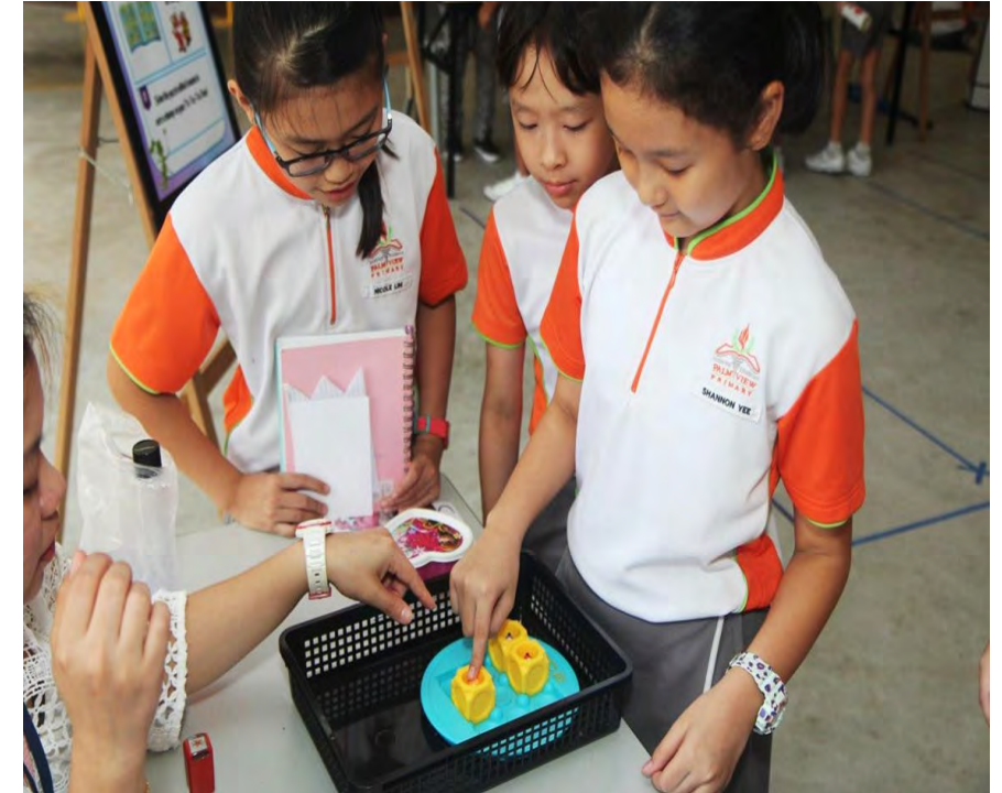
EL & Math Carnival Week